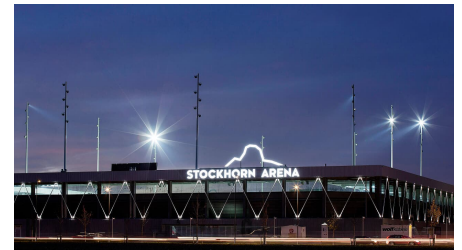
Stockhorn Arena, Interlaken Tourismus - web@interlaketourism.ch