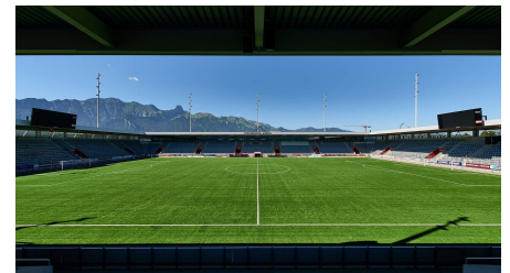
Stockhorn Arena