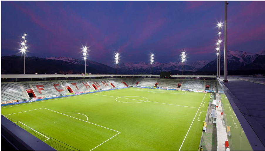
Stockhorn Arena, Interlaken Tourismus - web@interlaketourism.ch