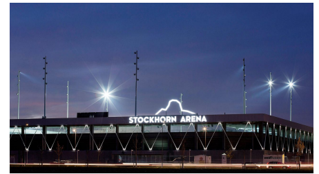
Stockhorn Arena