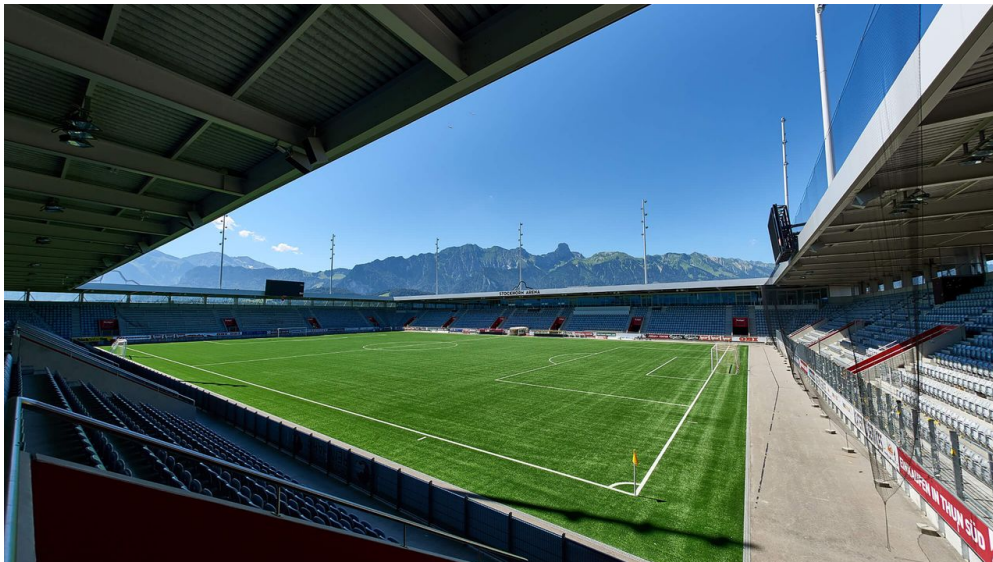
Stockhorn Arena

Guided tours of the stadium are available by appointment.