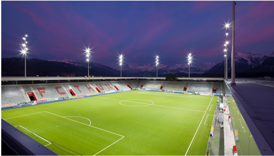
Stockhorn Arena