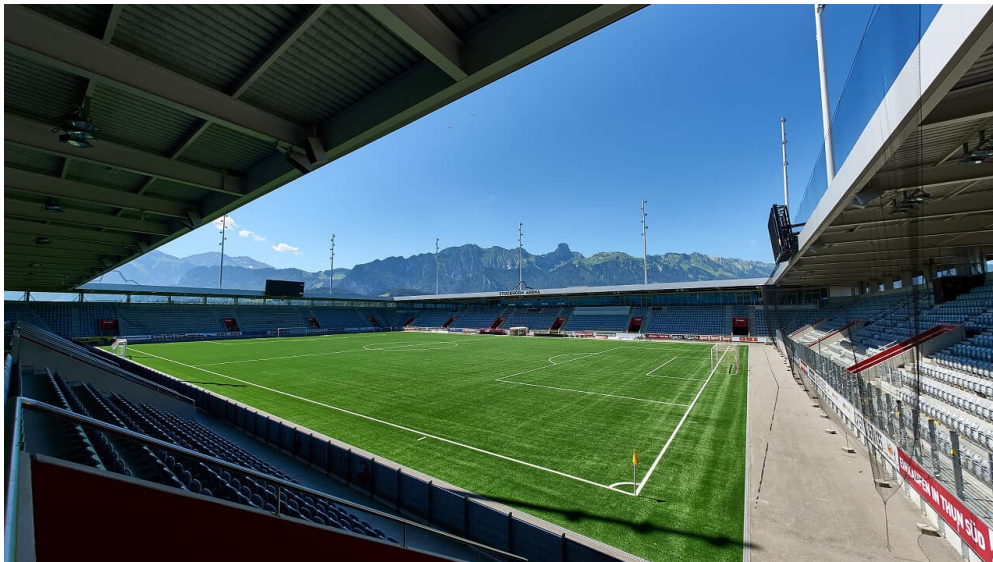
Stockhorn Arena, Interlaken Tourismus - web@interlaketourism.ch