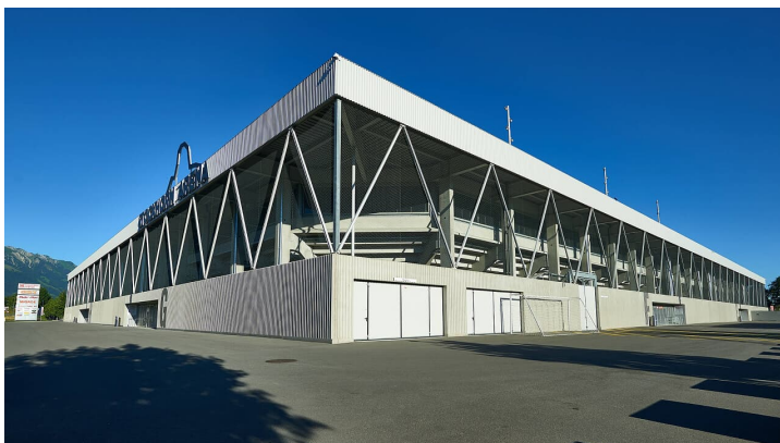
Stockhorn Arena