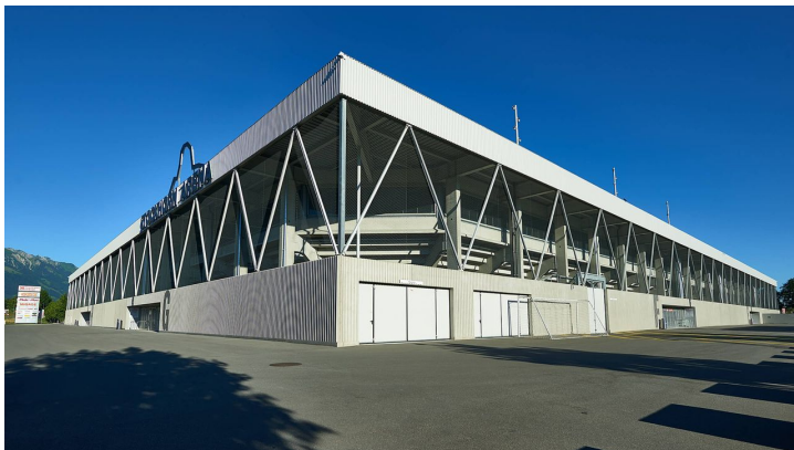
Stockhorn Arena