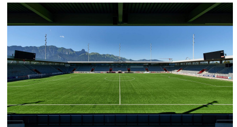
Stockhorn Arena