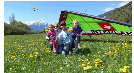
Hang Gliding Interlaken, Interlaken Tourismus - web@interlaketourism.ch