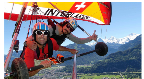
Hang Gliding Interlaken