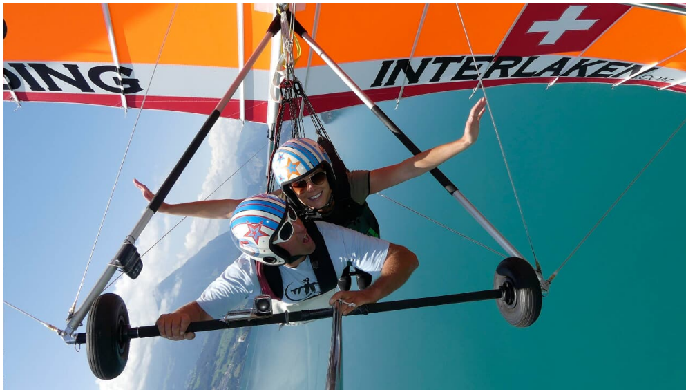
Hang Gliding Interlaken