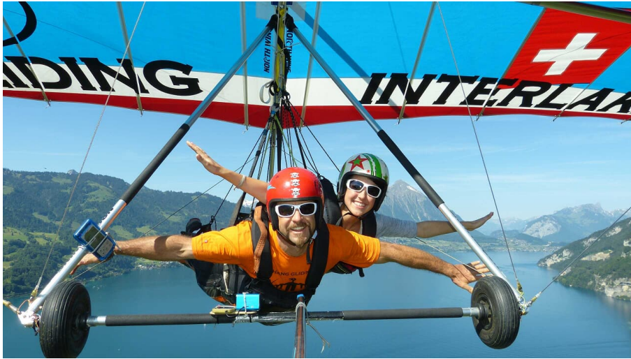
Hang Gliding Interlaken