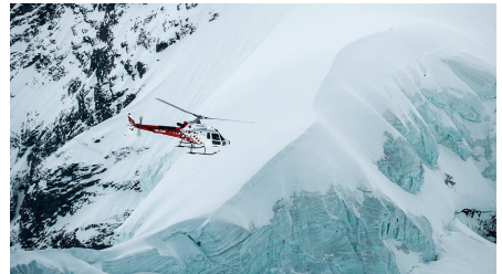
Air-Glacier SA, Interlaken Tourismus - web@interlaketourism.ch