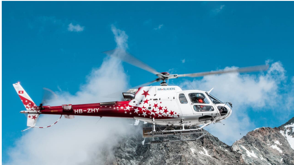
Air-Glacier SA, Interlaken Tourismus - web@interlaketourism.ch