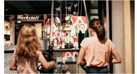
Trauffer Erlebniswelt