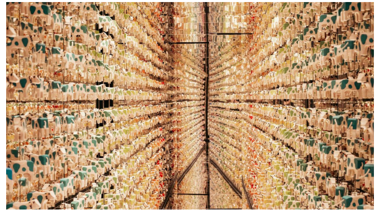
Trauffer Erlebniswelt