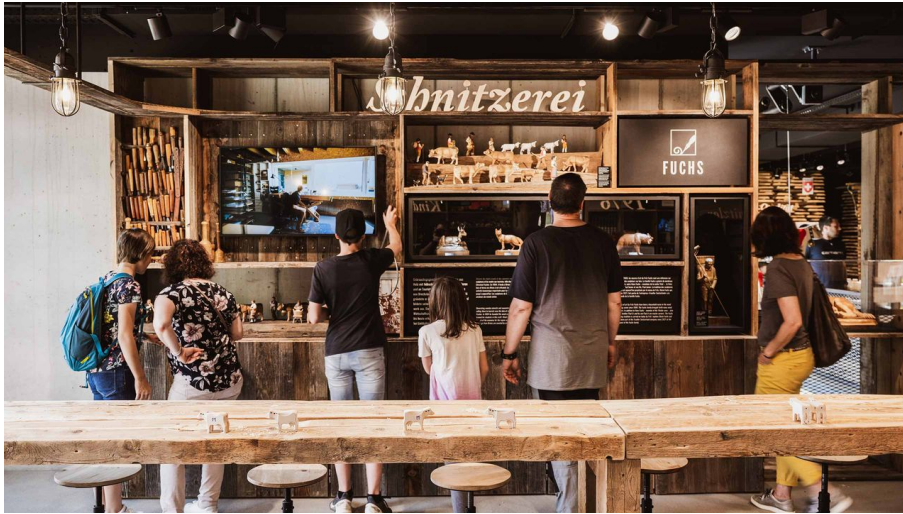
Trauffer Erlebniswelt