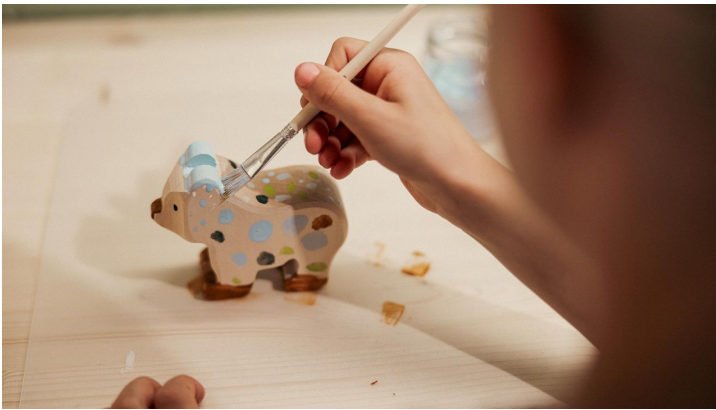
Trauffer Erlebniswelt, Interlaken Tourismus - web@interlaketourism.ch