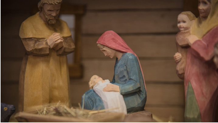
Huggler Holzbildhauerei AG, Interlaken Tourismus - web@interlaketourism.ch