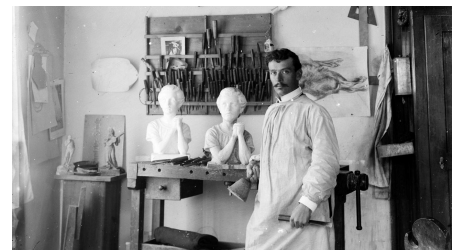
Huggler Holzbildhauerei AG, Interlaken Tourismus - web@interlaketourism.ch