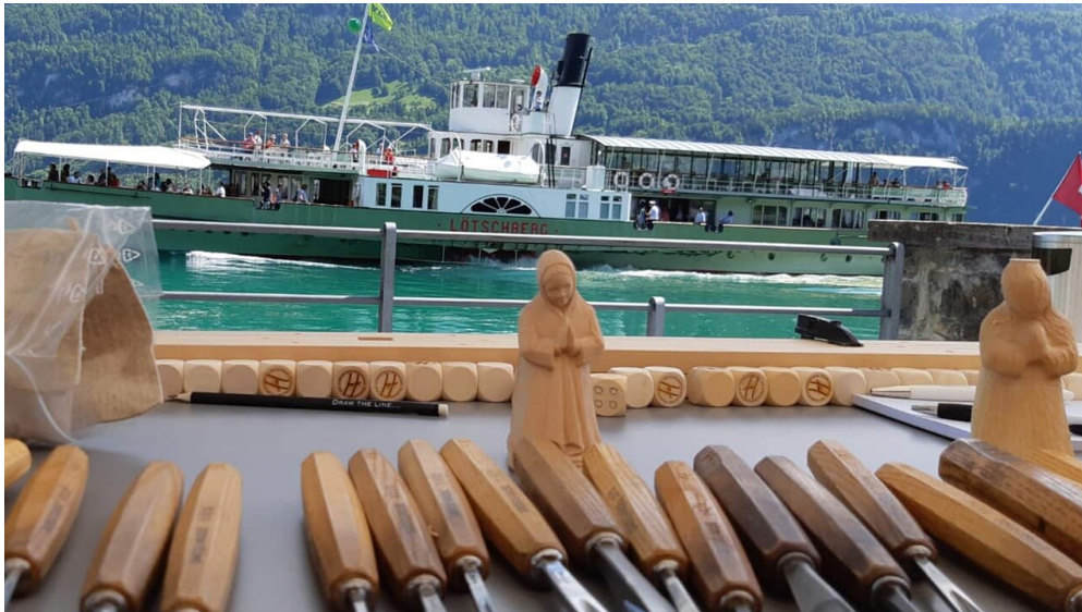
Huggler Holzbildhauerei AG, Interlaken Tourismus - web@interlaketourism.ch

Montag, 15.04.2024, 13:30 - 18:00 Uhr Dienstag, 16.04.2024, 08:00 - 12:00 Uhr Dienstag, 16.04.2024, 13:30 - 18:00 Uhr Mittwoch, 17.04.2024, 08:00 - 12:00 Uhr Mittwoch, 17.04.2024, 13:30 - 18:00 Uhr Donnerstag, 18.04.2024, 08:00 - 12:00 Uhr Donnerstag, 18.04.2024, 13:30 - 18:00 Uhr Freitag, 19.04.2024, 08:00 - 12:00 Uhr Freitag, 19.04.2024, 13:30 - 18:00 Uhr Samstag, 20.04.2024, 09:00 - 12:00 Uhr Samstag, 20.04.2024, 13:30 - 16:00 Uhr Montag, 22.04.2024, 08:00 - 12:00 Uhr Montag, 22.04.2024, 13:30 - 18:00 Uhr Dienstag, 23.04.2024, 08:00 - 12:00 Uhr Dienstag, 23.04.2024, 13:30 - 18:00 Uhr Mittwoch, 24.04.2024, 08:00 - 12:00 Uhr Mittwoch, 24.04.2024, 13:30 - 18:00 Uhr Donnerstag, 25.04.2024, 08:00 - 12:00 Uhr Donnerstag, 25.04.2024, 13:30 - 18:00 Uhr Freitag, 26.04.2024, 08:00 - 12:00 Uhr [...]