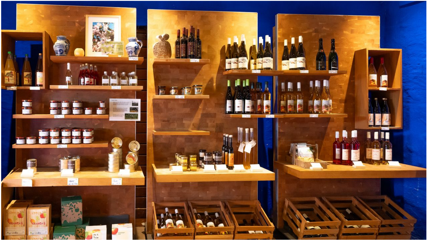
Frankfurt_Lohrberg mit MainÄppelHaus_1065091_©#visitfrankfurt_Isabela_Pacini.jpg