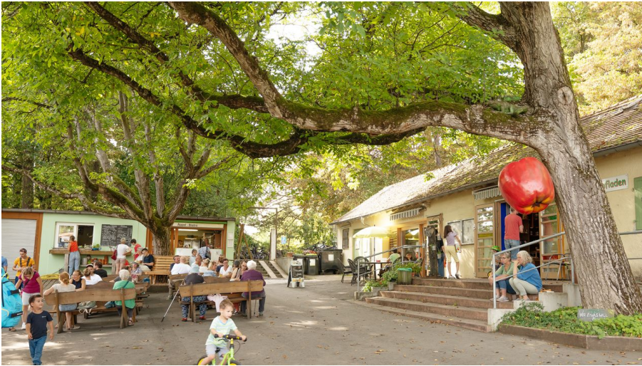
Frankfurt_Lohrberg mit MainÄppelHaus_1065081_©#visitfrankfurt_Isabela_Pacini.jpg