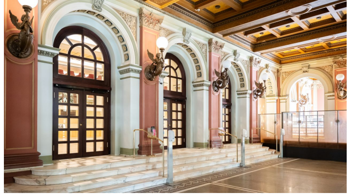
Frankfurt_Alte Oper_1040039_©#visitfrankfurt_Isabela_Pacini.jpg - © #visitfrankfurt_plazy_Isabela_Pacini