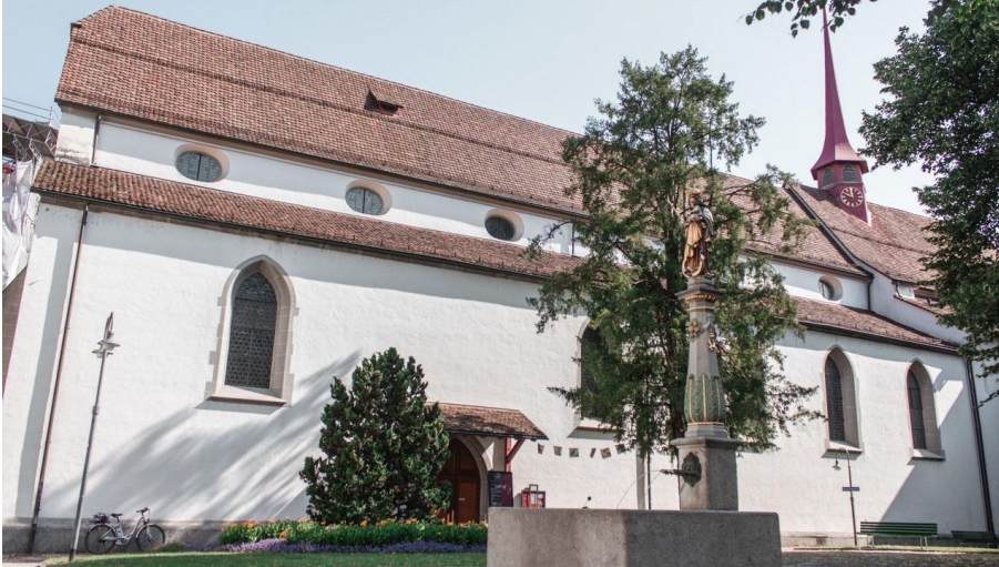
Franciscan Church