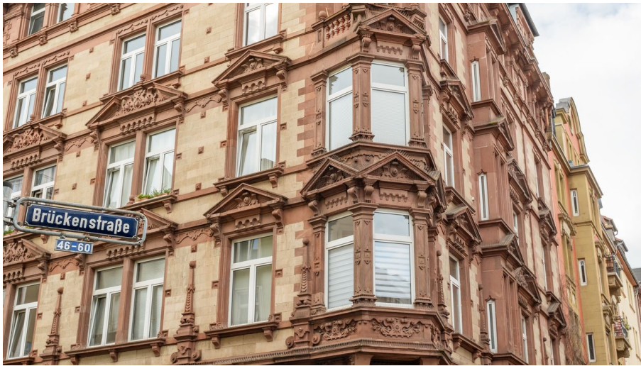
Frankfurt_Brückenviertel_1051390_© #visitfrankfurt_plazy_Isabela_Pacini (1).jpg - © #visitfrankfurt_plazy_Isabela_Pacini