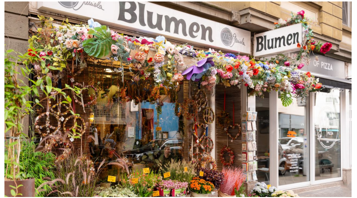
Frankfurt_Brückenviertel_1041381_© #visitfrankfurt_plazy_Isabela_Pacini.jpg - © #visitfrankfurt_plazy_Isabela_Pacini