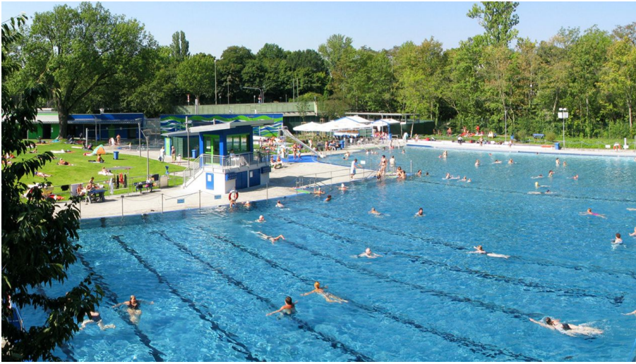
Freibad Hausen