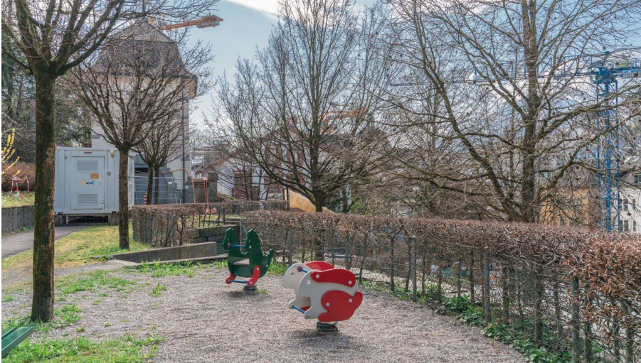
Laila Bosco, Luzern Tourismus AG