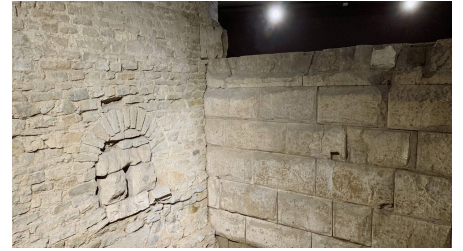
KölnTourismus