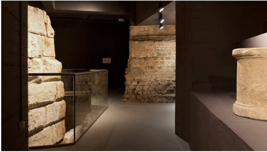
Römisch-Germanisches Museum der Stadt Köln / RBA / A. Wegner