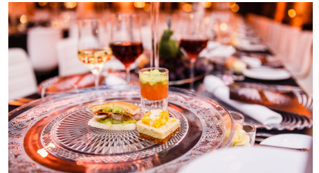
Kirberg Catering Harbour Club Köln.jpg - © Johannes Dreuw Photography, Kirberg Catering