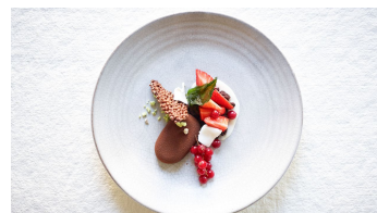
Kirberg Catering Mini Magnum in roter Gesellschaft.jpg