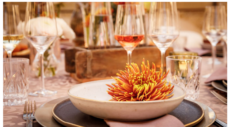
Kirberg Catering Event.jpg