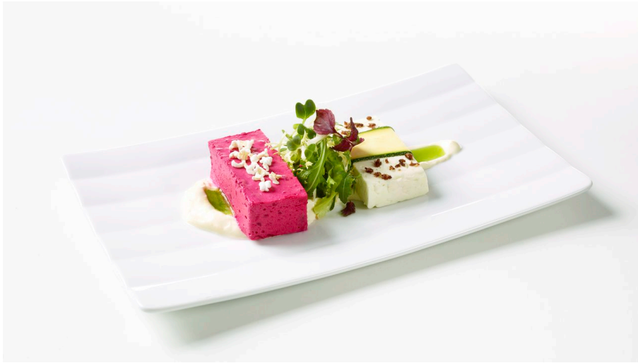
Kirberg Catering_Vorspeise