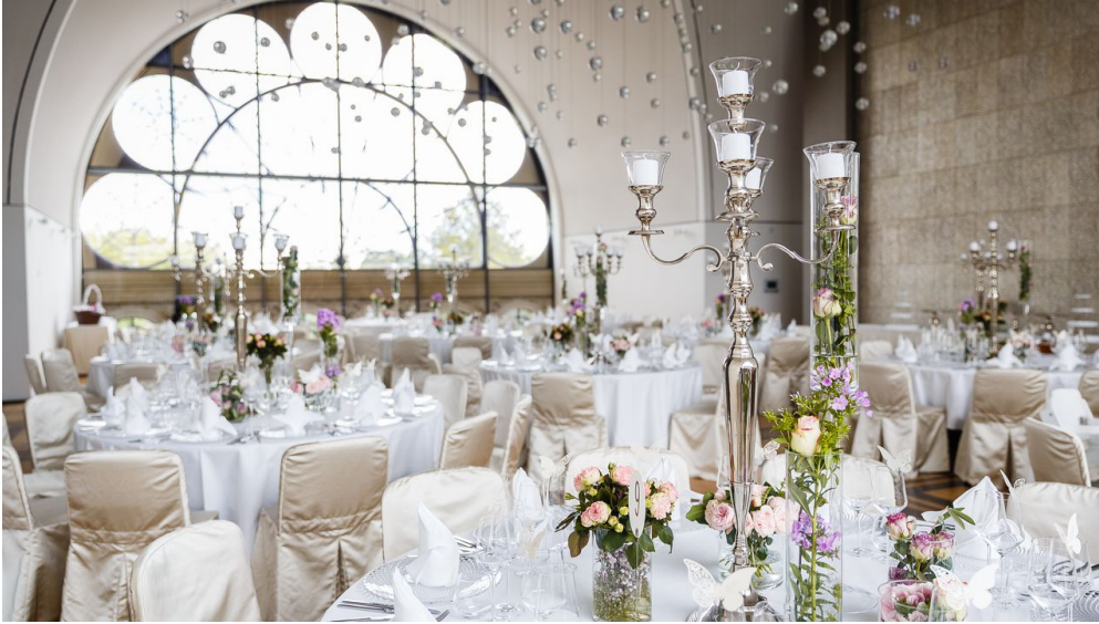
Kirberg Catering Hochzeit Dachsalon Flora Köln.jpg

ID: p_100202118 Last changed on 07.07.2024, 08:49