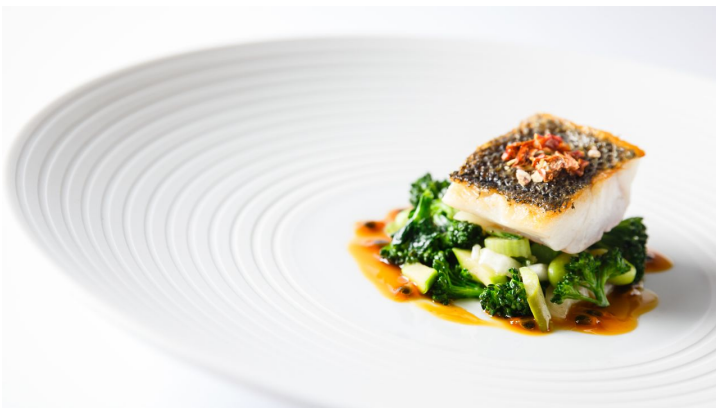
Kirberg Catering Hauptspeise.jpg