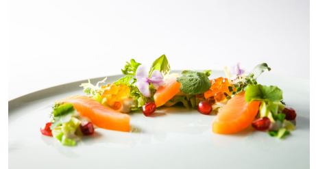
Kirberg Catering Vorspeise Lachs.jpg