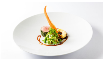
Kirberg Catering Hauptspeise.jpg