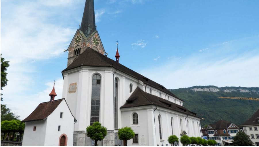
Stans parish church