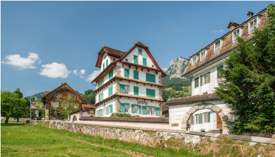
Palace of Hettlingen