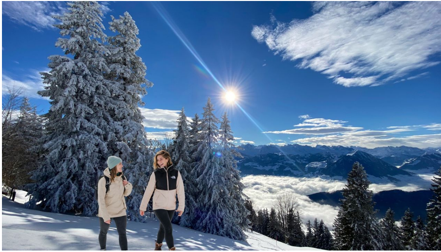
Zwei Freundinnen auf dem Rigi Panoramaweg