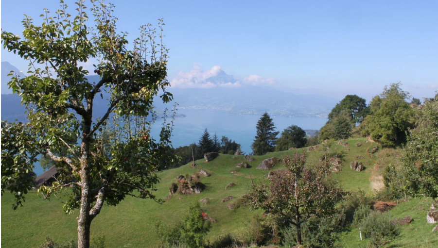
Tourist Information Weggis (Luzern Tourismus AG), Tourist Information Weggis