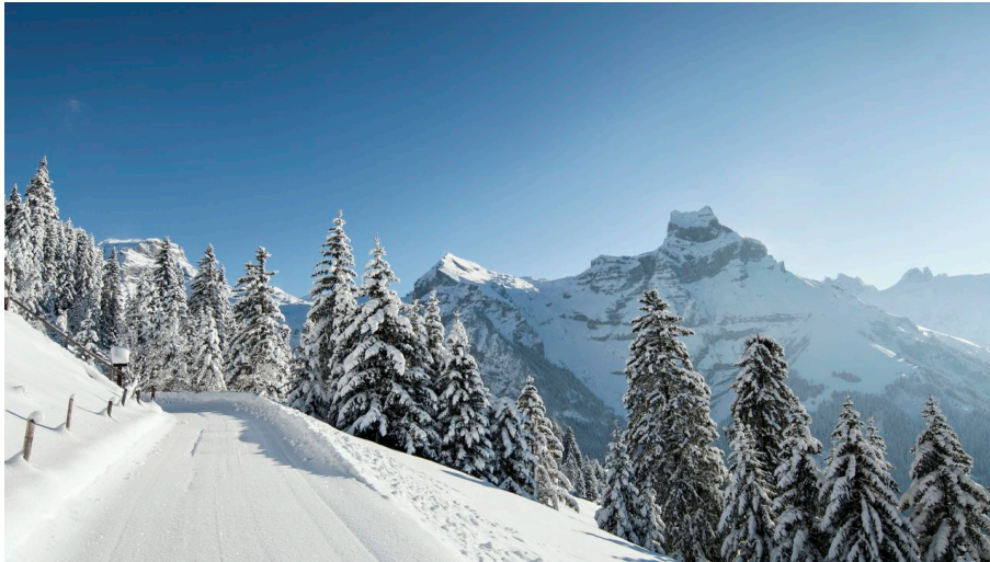
Engelberg - Titlis Tourismus, Engelberg-Titlis Tourismus