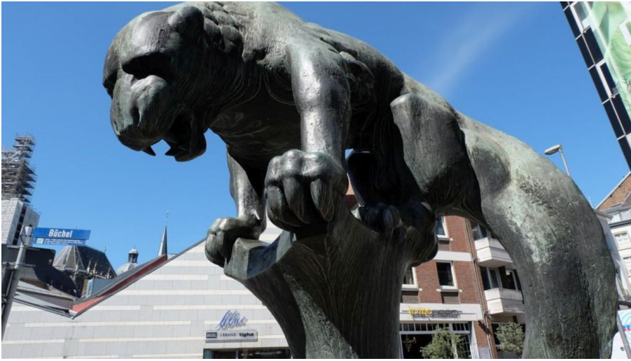
aachen tourist service e.v.