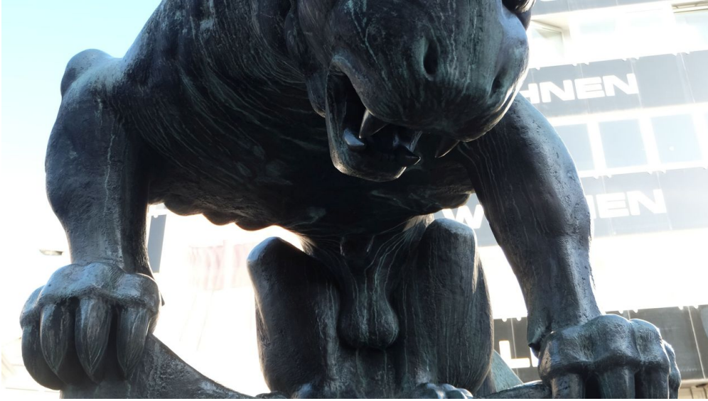
aachen tourist service e.v.