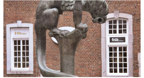
aachen tourist service e.v. / Strunk