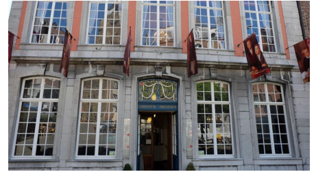
aachen tourist service e.v.