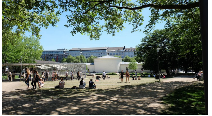
aachen tourist service e.v.