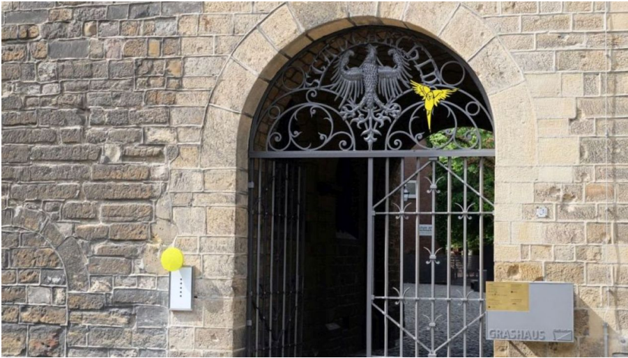
aachen tourist service e.v.