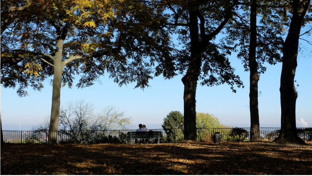
aachen tourist service e.v.