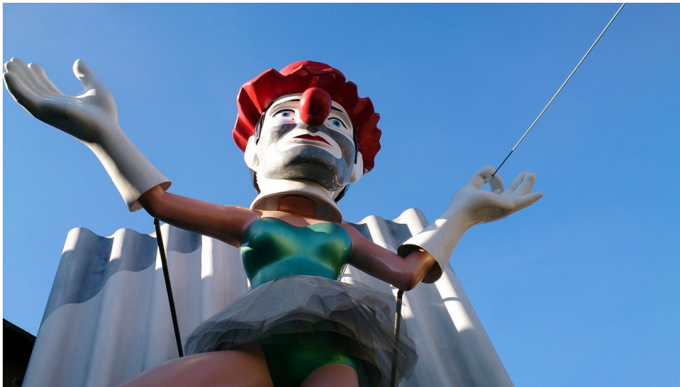
aachen tourist service e.v.

Closed: 24.12., 25.12., 31.12., Carnival Thursday , Carnival Sunday and Carnival Monday