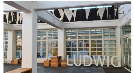
aachen tourist service e.v.