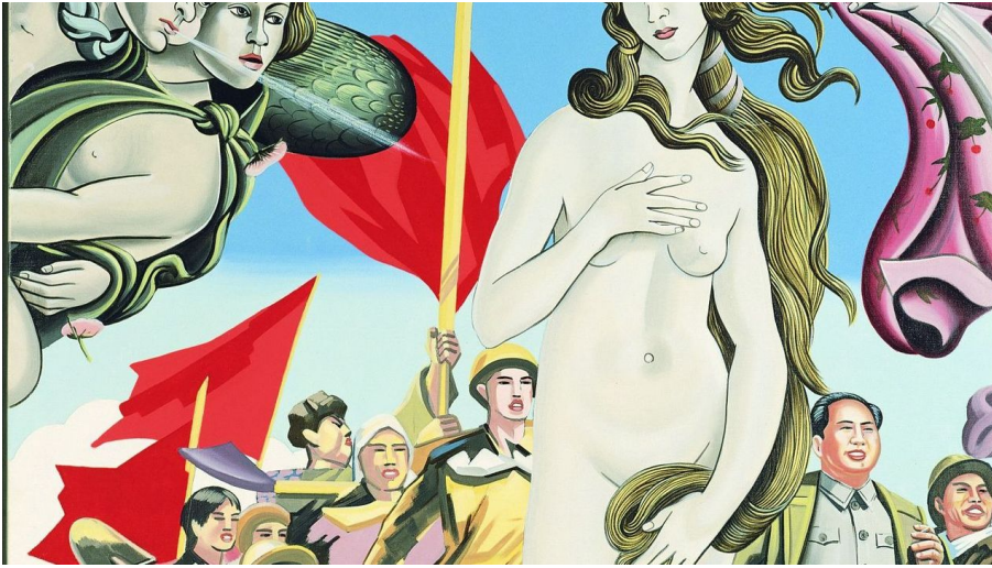
Erro, Venus, 1975. Aus dem Zyklus Tableaux Chinois, Ludwig Forum für Internationale Kunst Aachen, Schenkung Peter und Irene Ludwig © Erro/VG BildKunst Bonn, 2019.