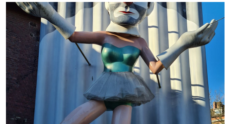
aachen tourist service e.v.