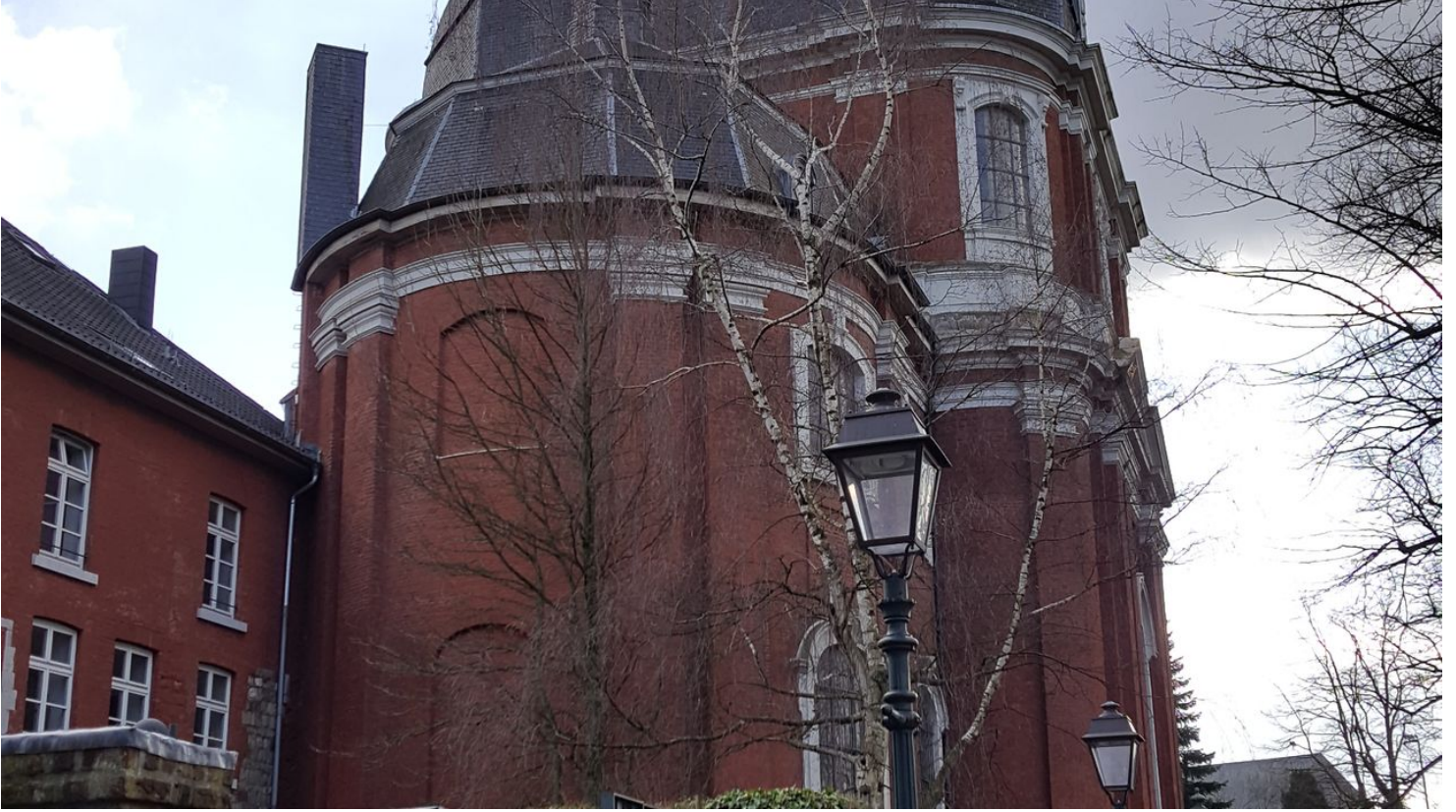
aachen tourist service e.v.