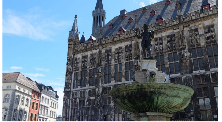
aachen tourist service e.v.