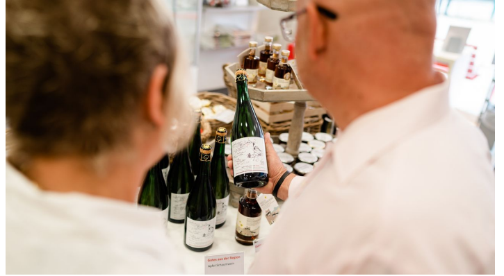
Kassel Marketing GmbH