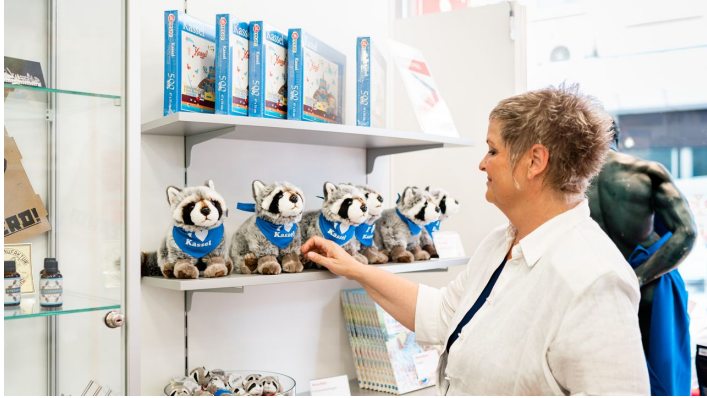
Kassel Marketing GmbH