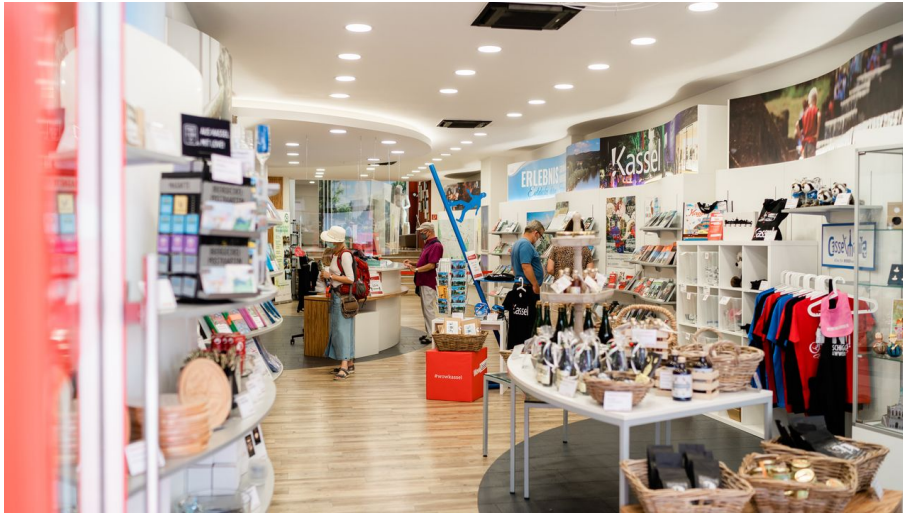
Kassel Marketing GmbH