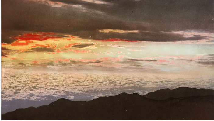
Museum Ludwig, Köln

Instagram ( https://www.instagram.com/MuseumLudwig/ )