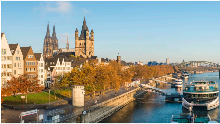
www.badurina.de, KölnTourismus GmbH, Tomy Badurina