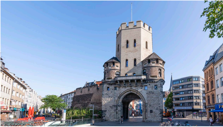
Severinstor-www.badurina-de-koelntourismus - © www.badurina.de, KölnTourismus GmbH