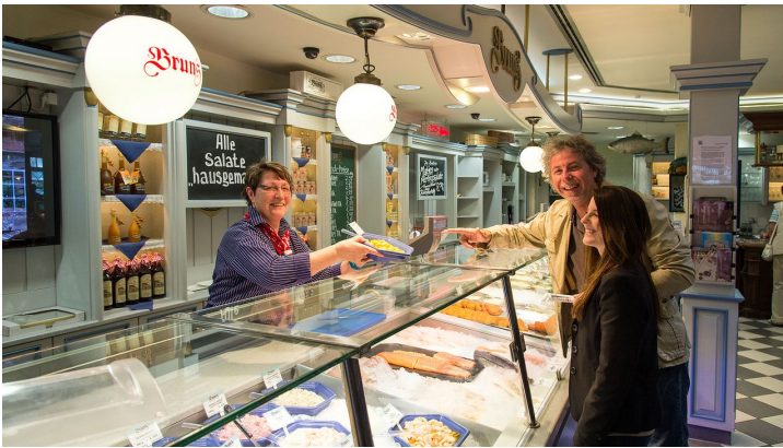
reinsch-fotodesign, Ekkehart Reinsch