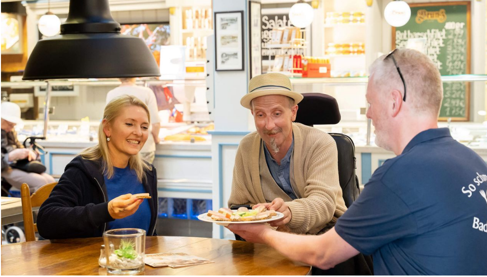
TourismusMarketing Niedersachsen GmbH , Isabella Pacini