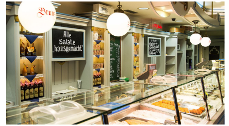
reinsch-fotodesign, Ekkehart Reinsch