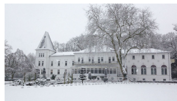
Bad Zwischenahner Touristik GmbH - info@bad-zwischenahn-touristik.de