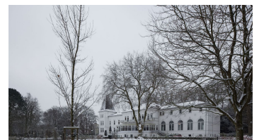
Bad Zwischenahner Touristik GmbH - info@bad-zwischenahn-touristik.de