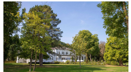
Bad Zwischenahner Touristik GmbH - info@bad-zwischenahn-touristik.de