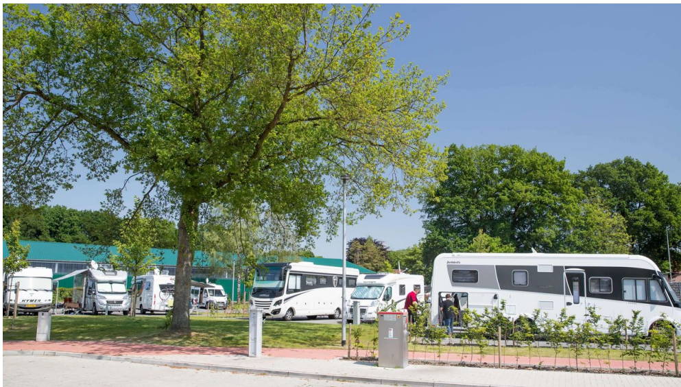
Bad Zwischenahner Touristik GmbH - info@bad-zwischenahn-touristik.de