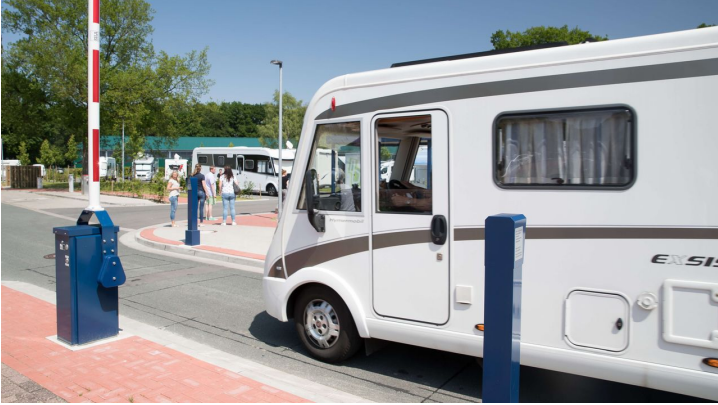
Bad Zwischenahner Touristik GmbH - info@bad-zwischenahn-touristik.de