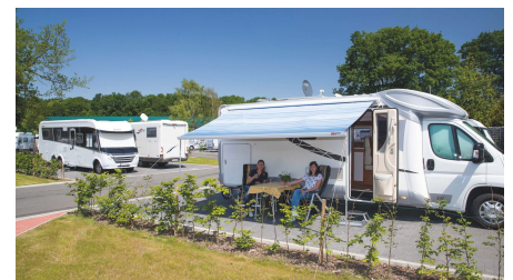
Bad Zwischenahner Touristik GmbH - info@bad-zwischenahn-touristik.de