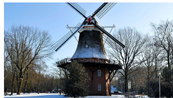
Bad Zwischenahner Touristik GmbH - info@bad-zwischenahn-touristik.de