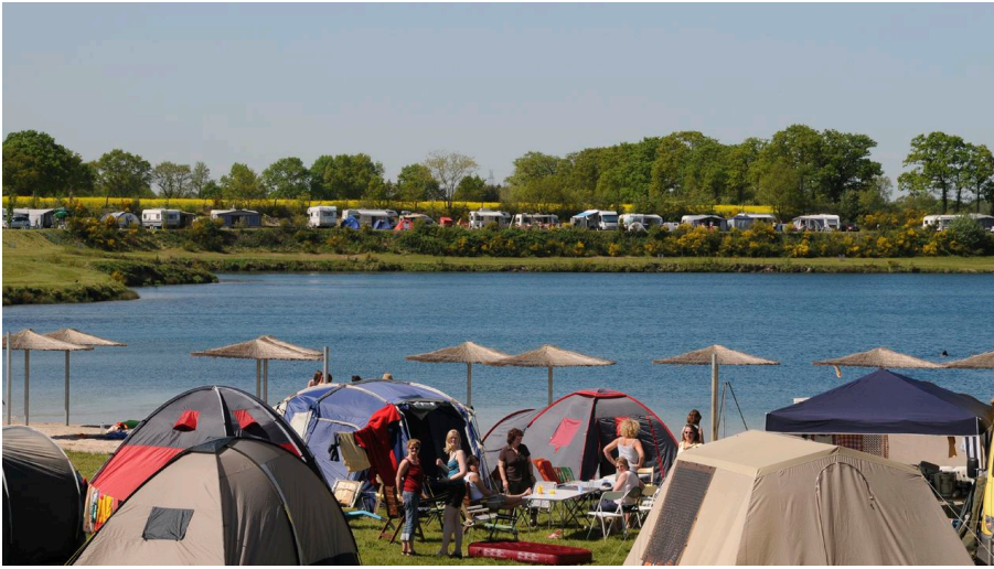
Ferienpark am Bernsteinsee - info@ferienpark-bernsteinsee.de