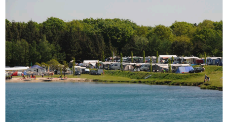
Ferienpark am Bernsteinsee - info@ferienpark-bernsteinsee.de