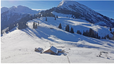
Alp Schwarzenberg