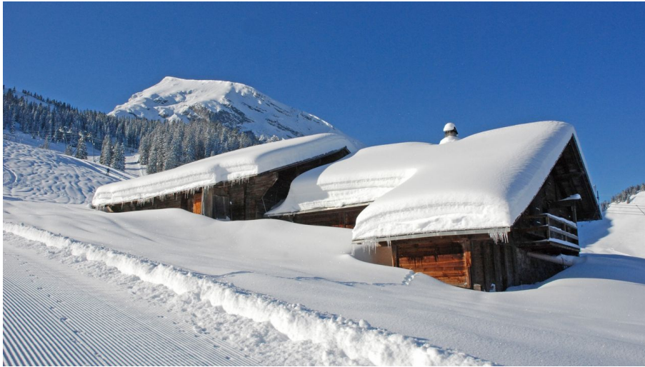
Blick auf Wiriehorn