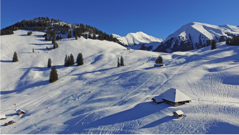
Wintersportgebiet Wiriehorn