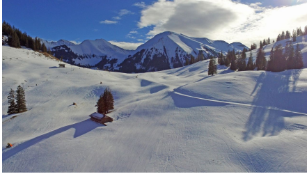
Schneereiche Perspektive im Gebiet Wiriehorn