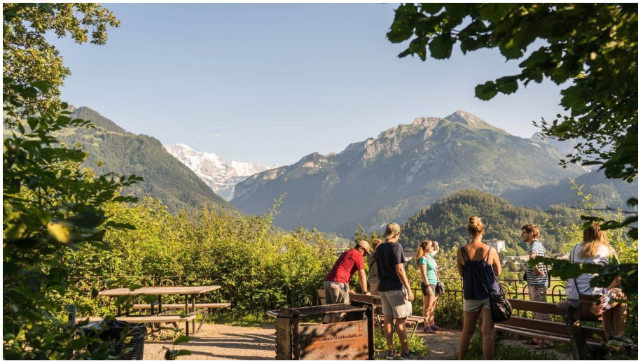
Interlaken Walking Tours, Interlaken Tourismus - web@interlaketourism.ch