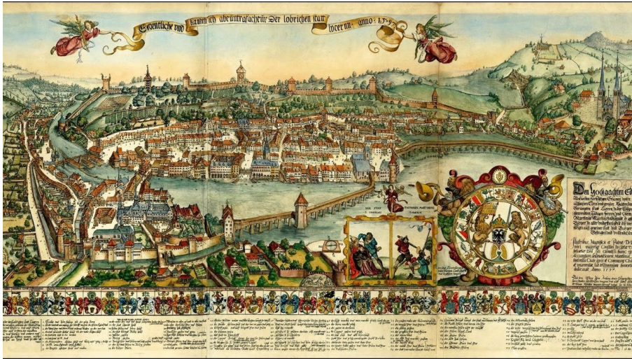
Martini Plan Lucerne, 1597