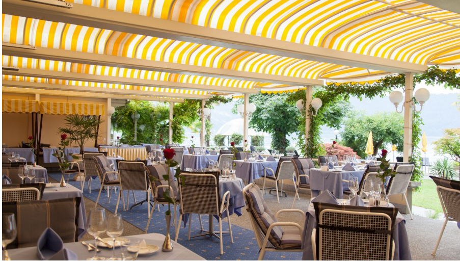
Garden terrace Beau Rivage