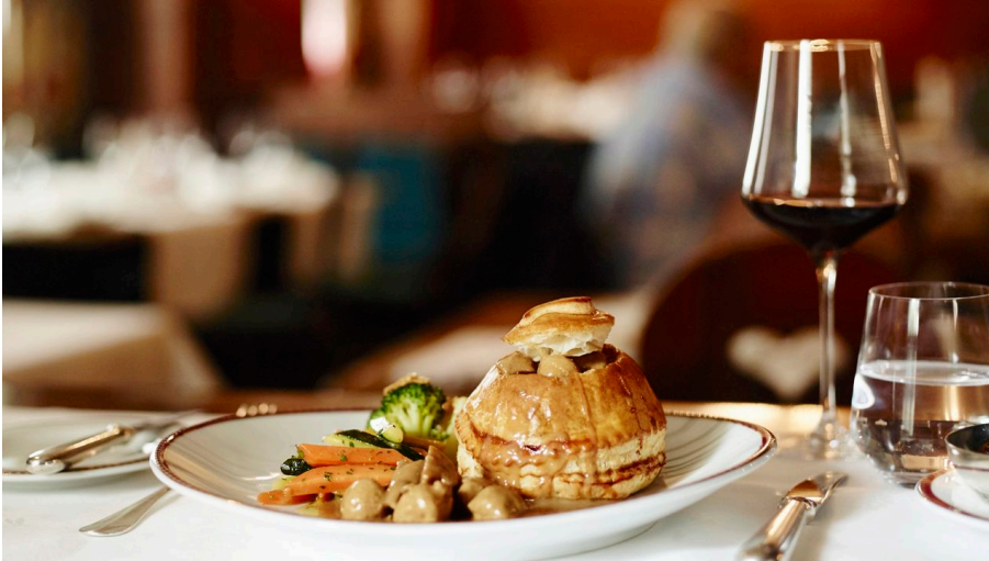
Hotel Wilden Mann Luzern, Luzern Tourismus