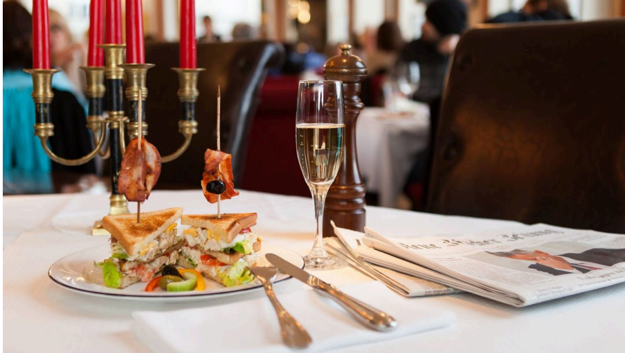
Café de Ville