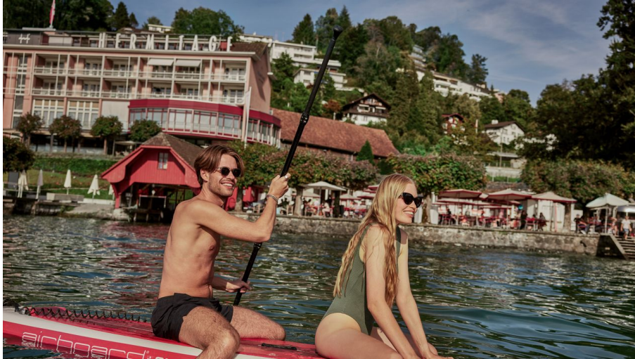
HERMITAGE Beach Club