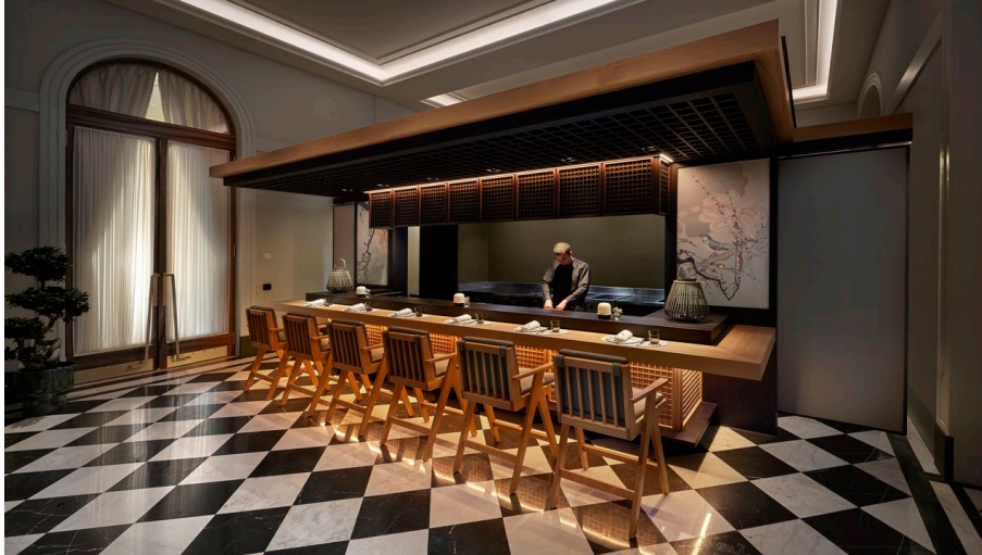
Mandarin Oriental Palace