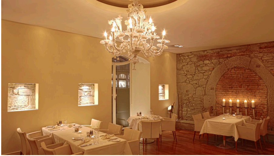
Oliver Stern, Luzern Tourismus