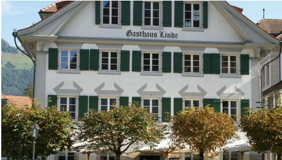
Linde Stans AG Terrace