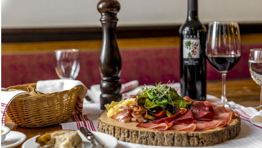
Rebstock Restaurant