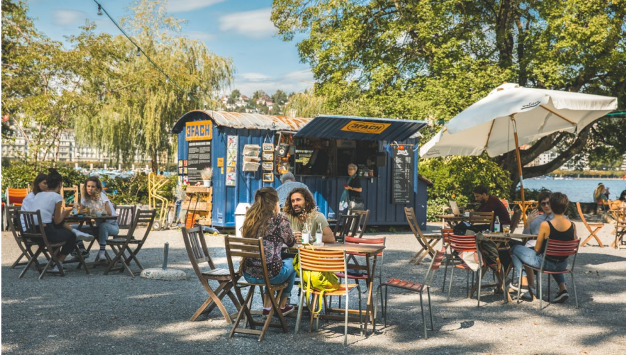
Summer at the Volière Lucerne