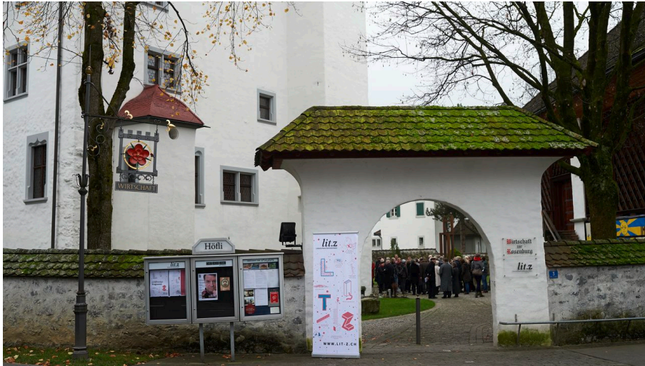
Wirtschaft zur Rosenberg outside