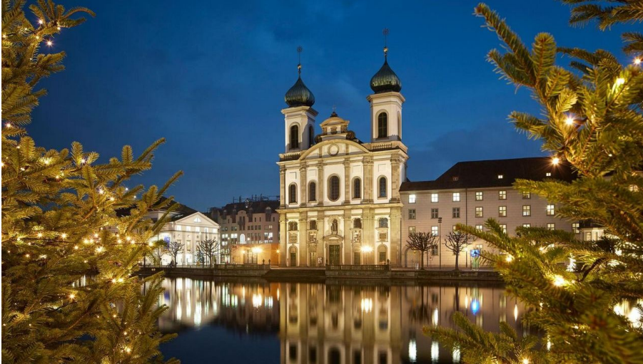
Luzern Tourismus, Beat Brechbühl