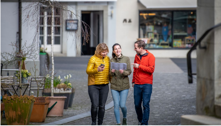
Willisau Crime Trail